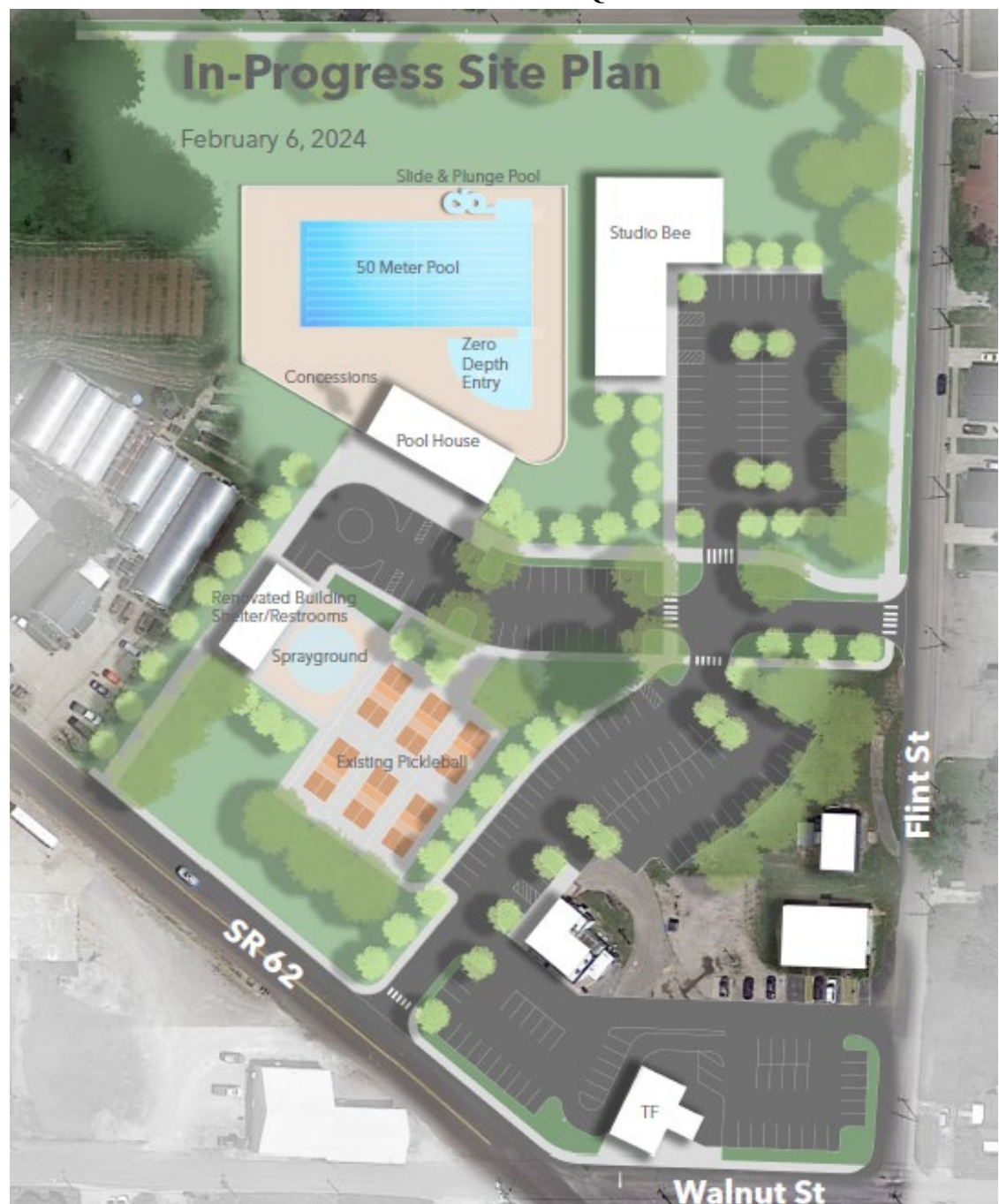
Attachment A SITE LOCATION – PROPOSED AQUATIC FACILITY